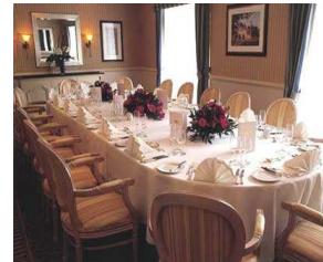
The Taj Room, Crowne Plaza Hotel, St. James

And don't forget to invite all potential new Sål members. This is the opportunity to show what Skå is all about.